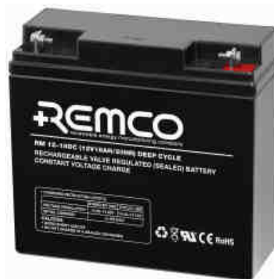
Type E Terminal Copper Inserted